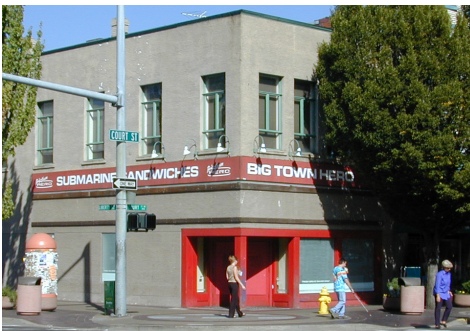
Vernon Jewelers: Before

Please contact the State Historic Preservation Office at 503-986-0690 for more information on any of the programs.