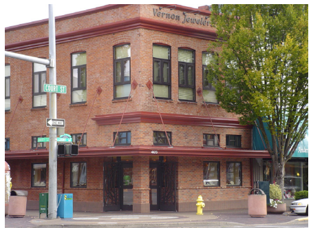
Vernon Jewelers: After