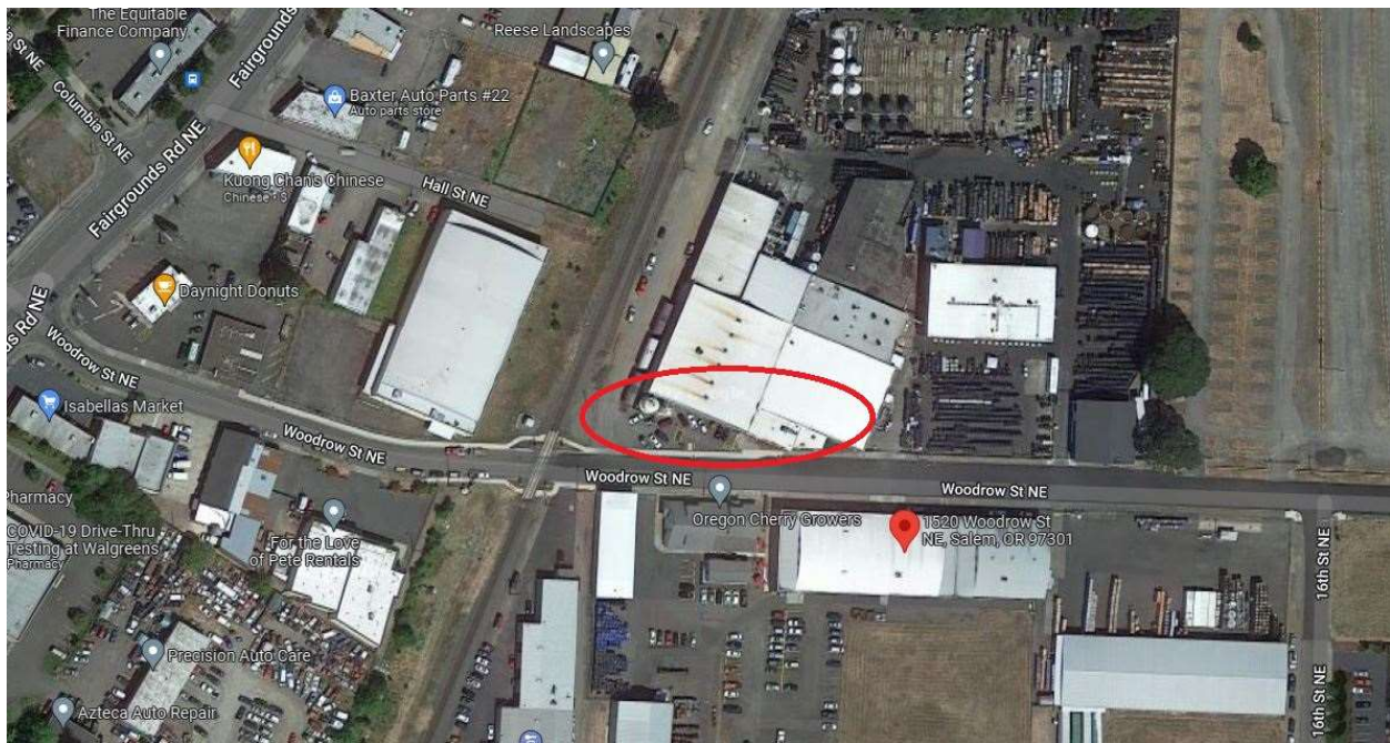
Figure 2 - Google Aerial View of Building and Property at 1520 Woodrow St NE, Salem, OR 97301