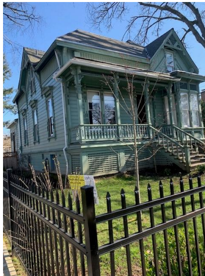
296 14 th Street NE. Connie Strong--