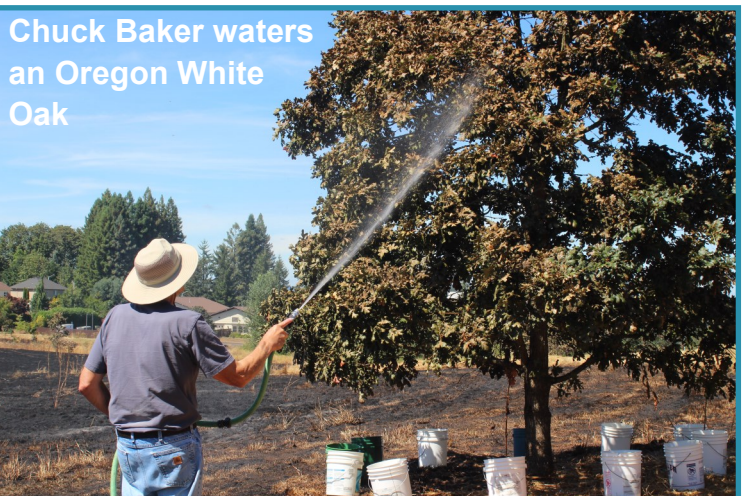
Chuck Baker waters an Oregon White Oak

The immediate and apparent damage is to grass and small trees. Mortality to wildlife is unknown, but voles have been seen peeking out from their entryways within the burned area. Birds feasted on grasshoppers, and two days after the fire, in the early morning, a red-tailed hawk had breakfast on the lawn of Fire Station #11 while a mother deer and fawn made their way up the slope, so for the wild creatures on the oak savanna, life goes on.