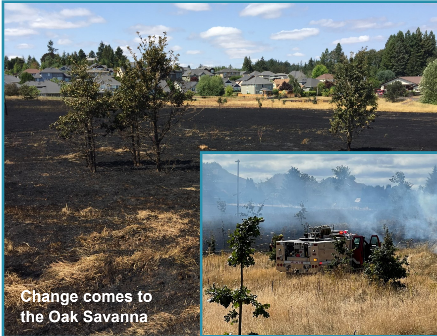
Change comes to the Oak Savanna

No injuries or property damage, aside from some heat damage to landscaping has been reported.