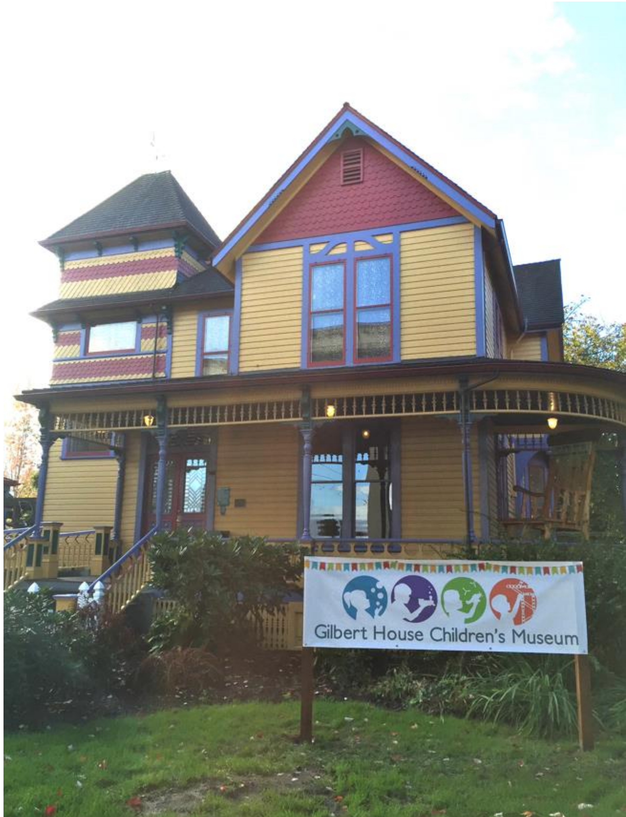
View of Existing Signage in Proposed Location