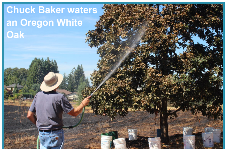
Chuck Baker waters an Oregon White Oak

The immediate and apparent damage is to grass and small trees. Mortality to wildlife is unknown, but voles have been seen peeking out from their entryways within the burned area. Birds feasted on grasshoppers, and two days after the fire, in the early morning, a red-tailed hawk had breakfast on the lawn of Fire Station #11 while a mother deer and fawn made their way up the slope, so for the wild creatures on the oak savanna, life goes on.