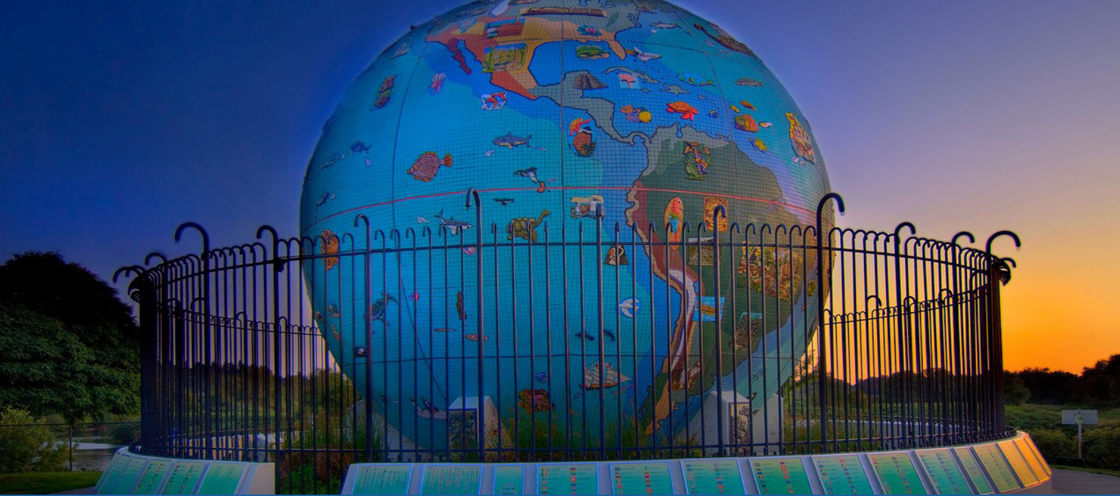
Eco-Earth Globe in Riverfront Park.