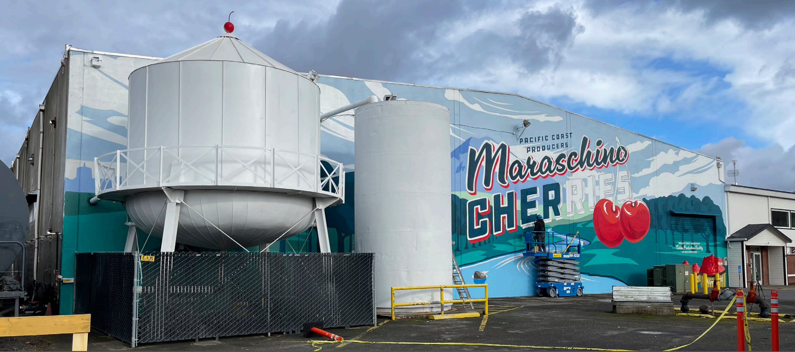
Public mural at Pacific Coast Producers, 1520 Woodrow St NE.

amendment underscores SPAC's steadfast commitment to fostering a diverse tapestry of public art, promoting innovation and inclusivity in creative expressions throughout Salem.