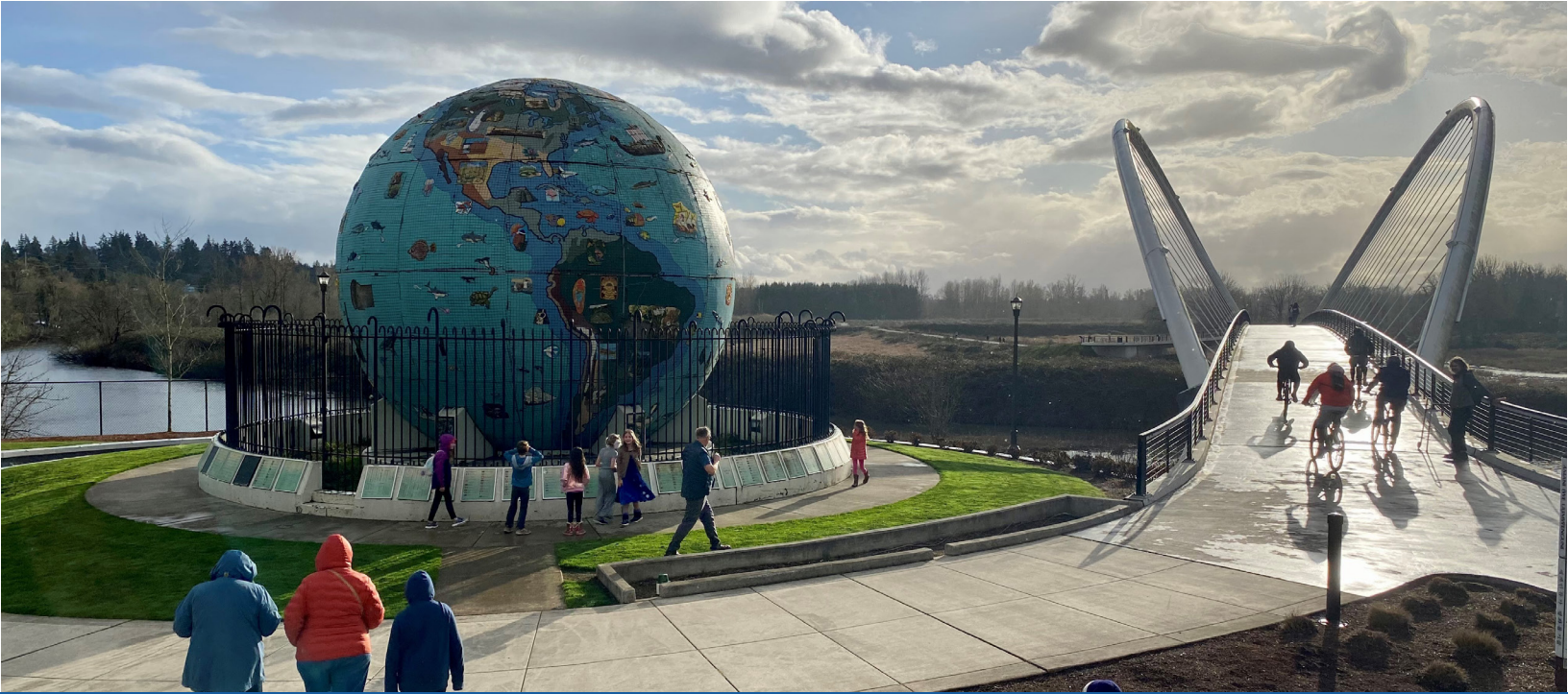
Eco-Earth Globe in Riverfront Park.