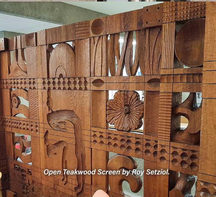
Open Teakwood Screen by Roy Setziol.