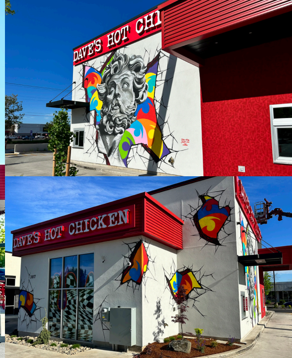
Public mural at Dave's Hot Chicken at 3817 Center St NE.