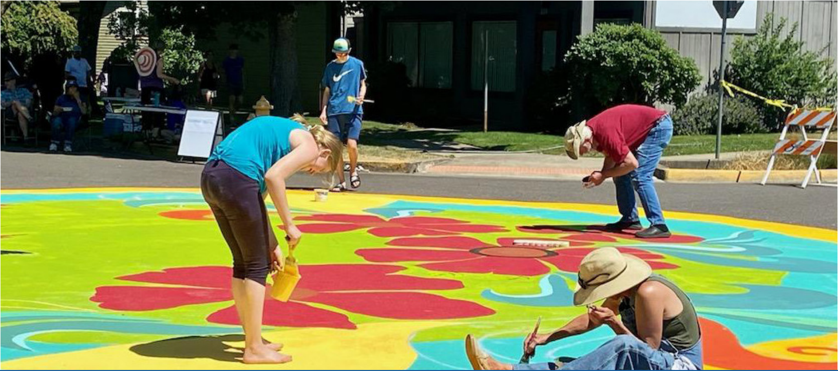
Street painting at 2nd St NW and Kingwood Ave NW.