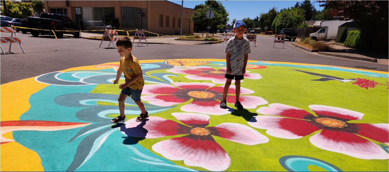
Street painting at 2nd St NW and Kingwood Ave NW.

two captivating street paintings graced Salem's streets, showcasing the collaborative efforts between neighborhood associations and the broader artistic community. West Salem Neighborhood Association contributed to the artistic landscape by creating a captivating street painting at the intersection of 2nd St NW and Kingwood Ave NW. This dynamic collaboration added an engaging visual element to the West Salem neighborhood, enhancing its unique character.