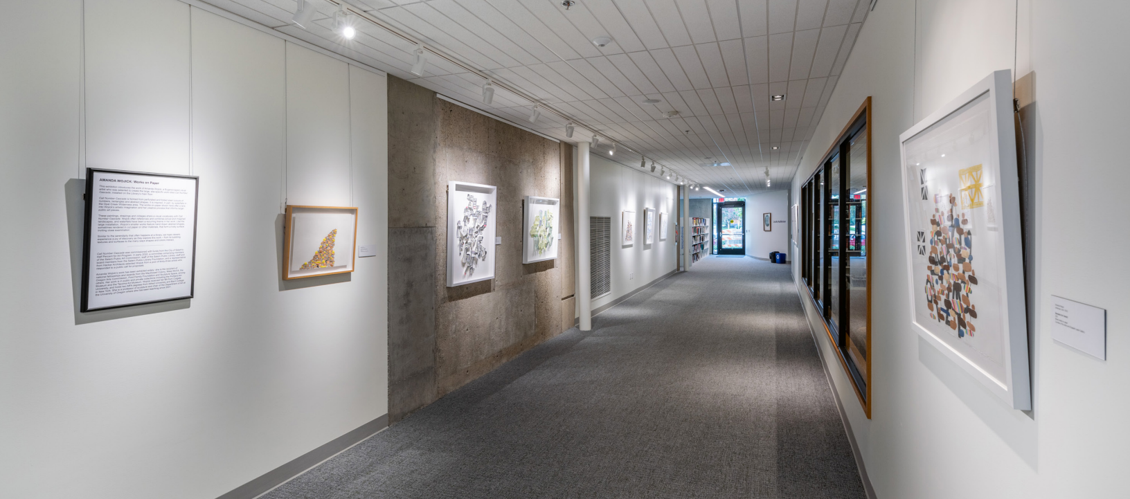
Library Art Hall in Salem Public Library. Quarterly exhibitions by Oregon Artist Series Foundation.

Foundation secure rotating shows of community art in the Library Art Hall / Exhibition Space. Below is a list of the 2023 exhibitions: