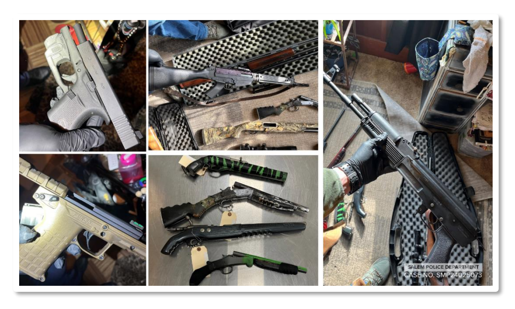
SMP2402507_Images of some of the firearms seized_2.png